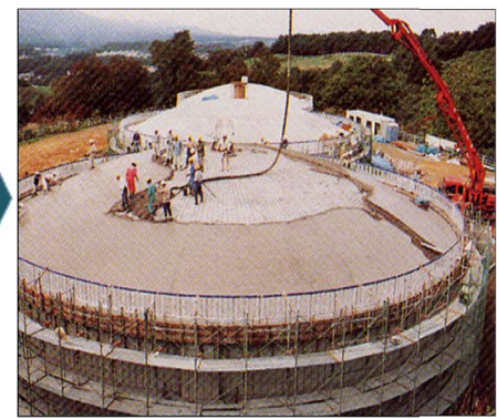
Placing the reinforcing bars of the dome, and casting concrete