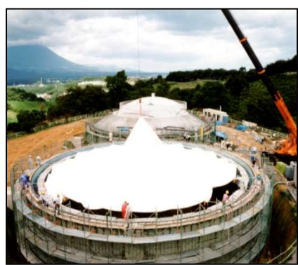
Lifting the membrane