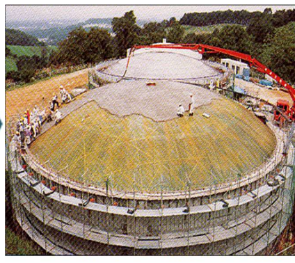
Applying adhesives and installing lath and welded wire mesh